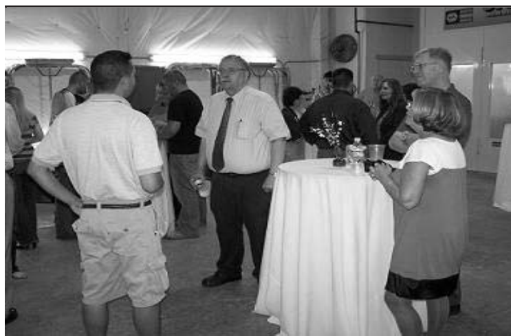
Stone City Service & Collision played host to the June Business After Hours.