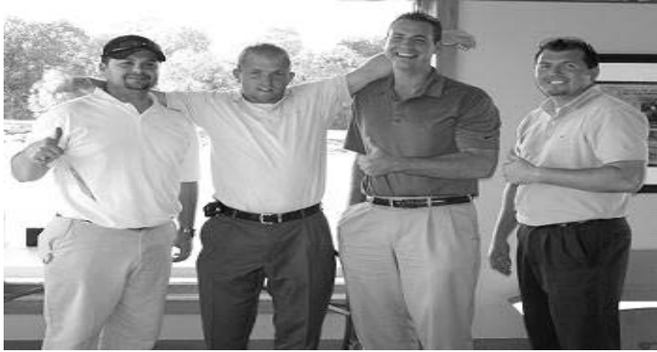
Wal-Mart own the Chamber Golf Outing 2008.