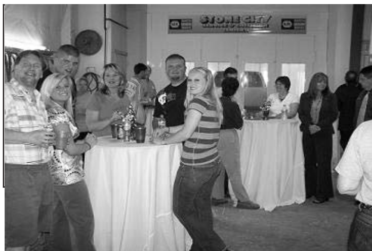
Stone City Service & Collision Center invited Chamber members and their guest to the June Business After Hours.