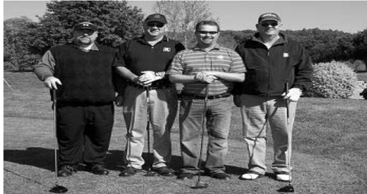
Rogers Group's team was second place