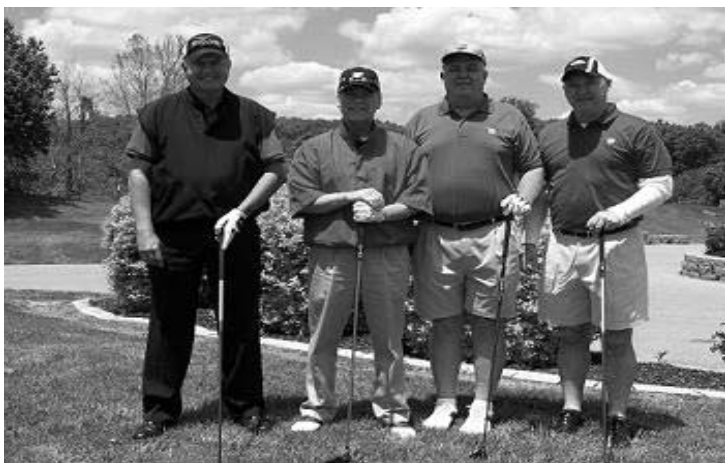
Third place winner of the Chamber Golf Outing 2008 was the team of the The Stone City Bank.