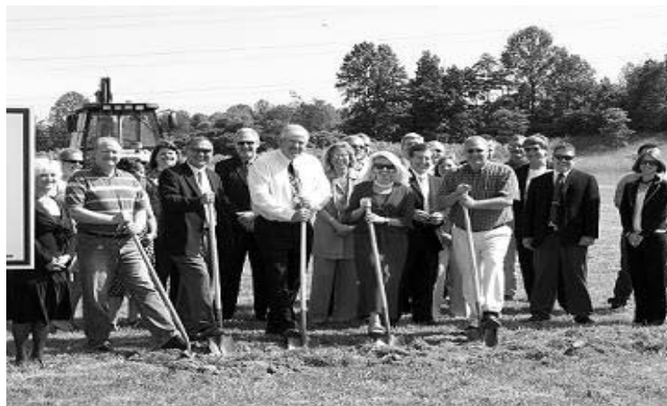
There was a Ground Breaking Ceremony for Flinn Farm Properties located on John Williams Blvd.