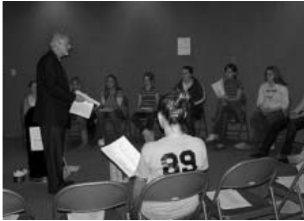
The Annual Welcome to the Real World 2007.

The chamber encourages all members to do business with each other. Companies, organizations and individuals listed below have recently made an important investment in their business by joining or renewing membership in the chamber.