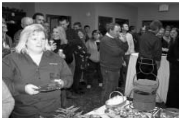
The Bedford Area Chamber of Commerce's Annual Membership Appreciation Holiday Reception 2007.

Fraternal Order of Eagles, #654 Brad Hawkins Construction, Inc. Hoosier Family Practice