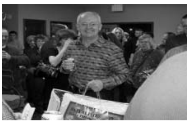
Guests at the Chamber's Membership Appreciation Holiday Reception enjoy networking, food, and prizes

The Chamber thanks the following businesses for their past support and hopes to see them among the Chamber membership ranks again in the future.