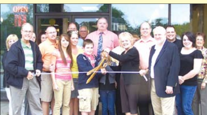
SUBACOS invited Chamber Members and their guests to their Ribbon Cutting, located at 2639 16th Street in Bedford.