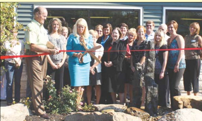
Garden Villa invited Chamber Members and their guests to their Ribbon Cutting, located at 2111 Norton Lane in Bedford. Beautiful updates both inside & outside the facility were officially presented.